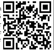
Conf Registration QR Code